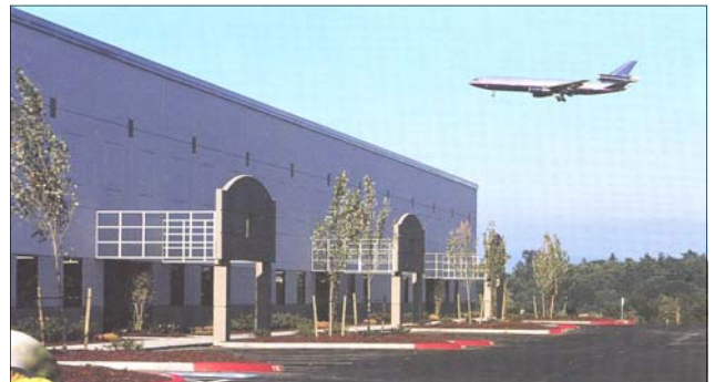
Premier Airfreight Facility in Seattle